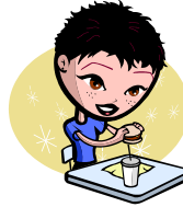
Eat at different times