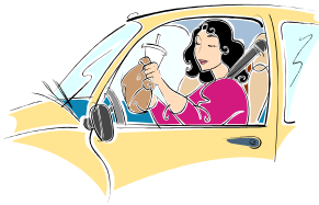
Fast Food in the car